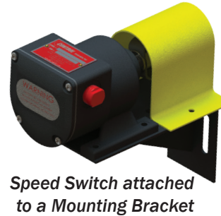
Speed Switch attached to a Mounting Bracket